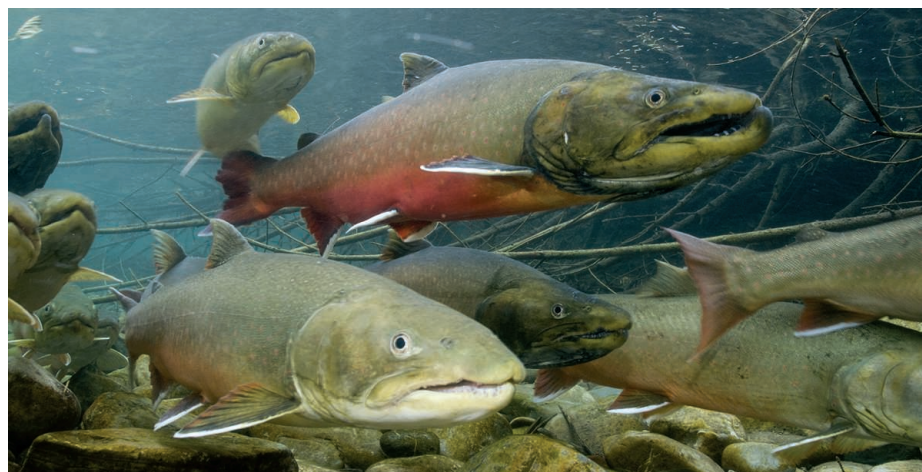
Many trout species, such as these native bull trout, are endangered.

Reversing these declines will require progressive conservation efforts to protect native trout diversity and ameliorate ongoing and future threats at local and global scales. To preserve these unique fishes, we must protect ecological and genetic diversity, which are critical for long-term resiliency, viability, and adaptation in the face of rapid environmental change. Innovative conservation approaches include reconnecting rivers with floodplains, establishing native fish refuges, restoring habitat diversity, and reducing invasive species, including non-native trout stocking programs. Moreover, comprehensive, coordinated, and comparable approaches are needed immediately to assess conservation status and to delineate conservation units across the globe, particularly for data-poor species. Only by